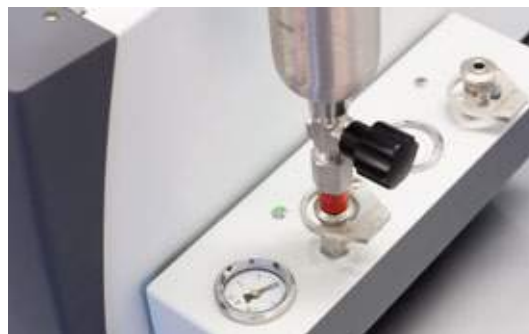
Configuration: GLS with safety lock*

The GLS automatic safety mechanism detects pressure in the connection between the sample cylinder and the GLS. As long pressure is detected, the safety lock will automatically prevent unintended removal of the pressurized sample cylinder. The moment the operator has closed the cylinder and pressure has been released in the connection, the safety lock will automatically drop for removal of the sample cylinder.