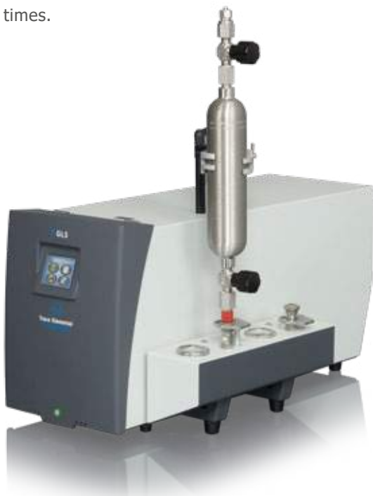
Configuration: GLS with safety lock*

The chosen analysis method is being executed and the pre-set number of sample loops is run and analyzed. Parameters like evaporation speed, temperature, flow and pressure are automatically controlled and monitored at all times.