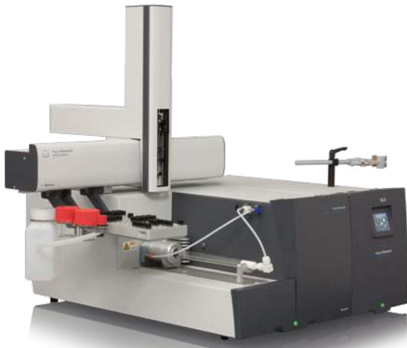
Configuration: XPLORER with ARCHIE and GLS*