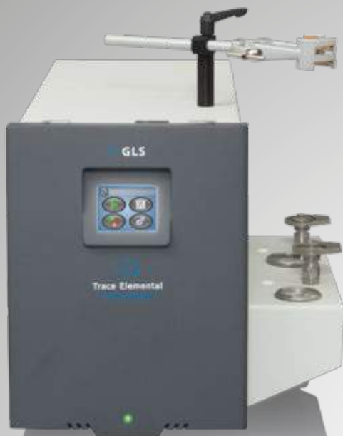
Configuration: GLS with safety lock*